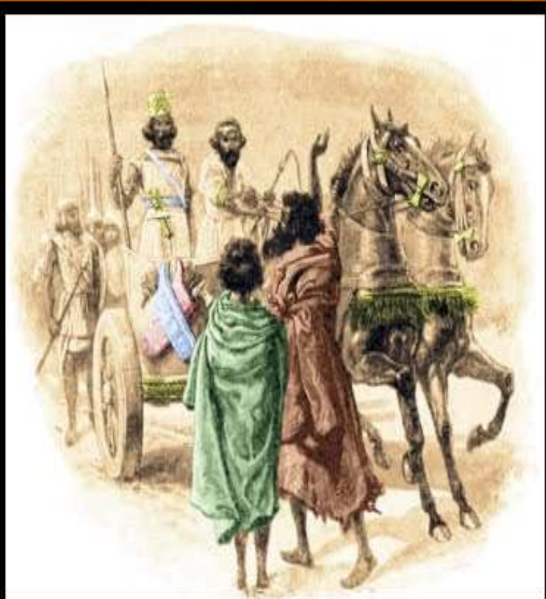
ISAIAH WARNING AHAZ