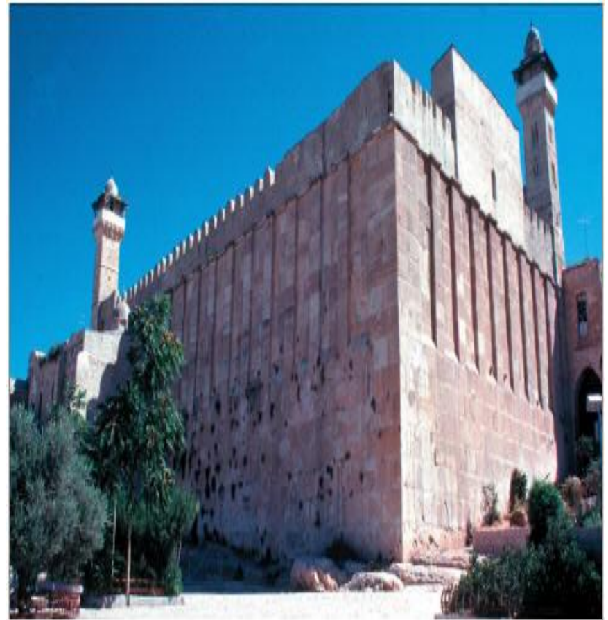
Tomb of the Patriarchs—built on the traditional site of the biblical Cave of Machpelah.