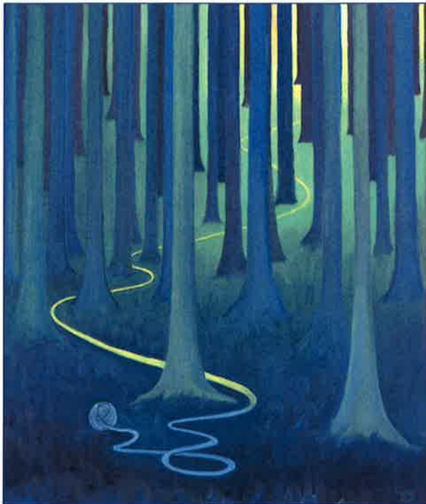
Our daily duties are like a golden string that shows us God's will and leads us to Heaven. (T-01445-0L)