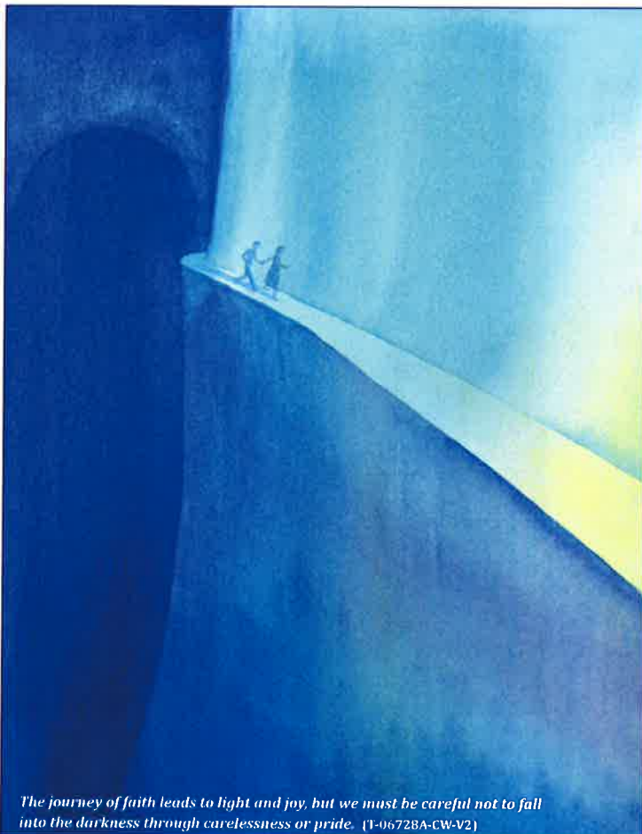
The journey of faith leads to light and joy, but we must be careful not to fall into the darkness through carelessness or pride. (T-06728A-CW-V2)

For these people of goodwill, the moods, thoughts and feelings that come from our lives being in tune with the Holy Spirit tend to be things like love, gentle inspiration, peace, courage, hope, openness, strength or repentance. (See fruits of the Spirit in Galatians 5:22.) These movements help the person to engage in life, to 'choose life', they are welcomed and appreciated.