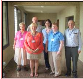
Delegates of E&W and Latvia in Lebanon

I was asked to write a small column about the CLC in Latvia, that our new God-parents can meet virtually and start to know us step by step. Here in Latvia, we